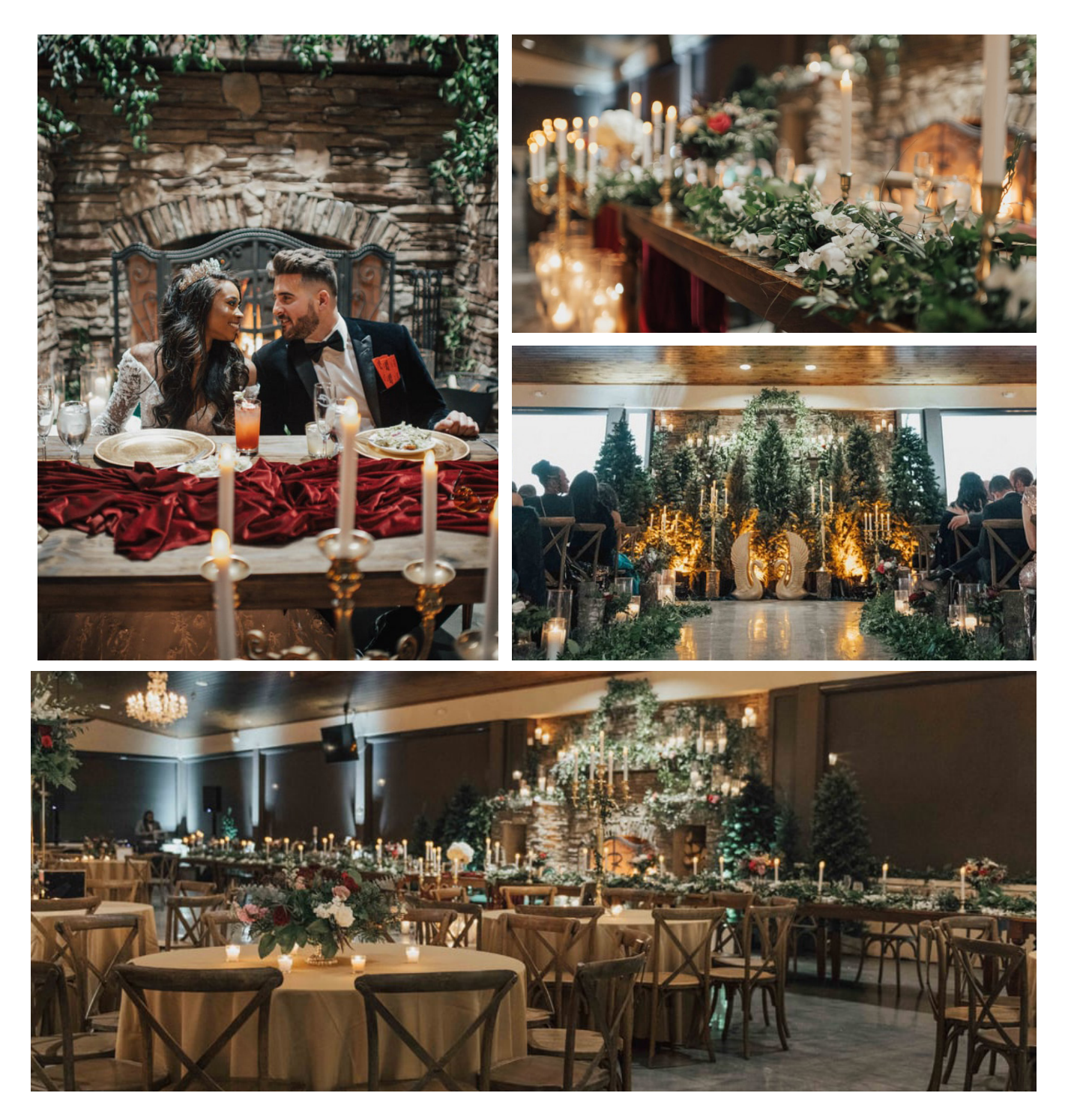
Childress Vineyards Weddings